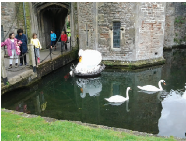
Fig. 4. An example of a cultural service. Two mute swans Cygnus olor are accompanied by 1 of 60 swan sculptures made in Wells, England to commemorate the Queen's jubilee in 2012. People have a particular affection for swans and other large waterbirds.

This is a multiscale service, upholding biodiversity locally, regionally and even at continental scales (see Section IV.8).