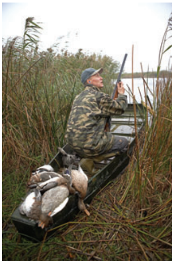
Fig. 2. Duck hunting in Sweden. Waterbirds have provided a provisioning service via hunting throughout history, and the modern economic benefits are a powerful force for wetland management and conservation.

concerned primarily with the ecological role of birds, and we will not consider these cultural services in further detail (but see Kear, 1990).