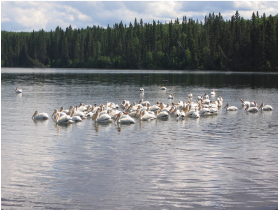
Fig. 5. American white pelicans Pelecanus erythrorhynchos in Prince Albert National Park, Canada. Piscivorous waterbirds can reduce the impact of fish on the diversity of invertebrates by reducing fish activity owing to the fear of predation. They can also control the populations of undesirable, alien fish. Colonial waterbirds such as pelicans also provide important subsidies of nutrients to terrestrial areas where they breed.

such events might be more frequent were it not for the influence of piscivorous birds. For example, herons, storks, ibises and other wading birds are able to significantly reduce fish populations from waterbodies as water levels decrease during dry periods (Kushlan, 1976; Gawlik, 2002), thus avoiding synchronous fish mortalities and effectively removing nutrients en masse from those wetlands. This in turn may help to reduce outbreaks of toxic cyanobacteria associated with hypertrophy, as well as the anoxia events and disease outbreaks that result from large quantities of fish decomposing. In experimental ponds in the Everglades, after 12 days birds had removed all fish in ponds of 10 cm depth, and over 50% of fish in ponds of 28 cm depth (Gawlik, 2002).