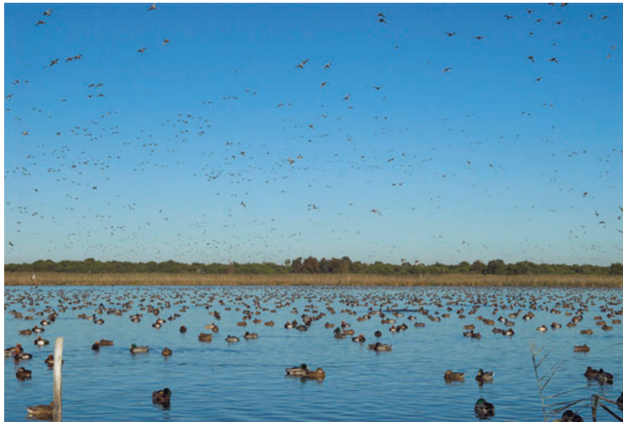
Fig. 3. Ducks wintering in the Albufera de Valencia, eastern Spain. Such wintering concentrations can provide a spectacle for the public (i.e. a cultural service), an opportunity for controlled harvest (a provisioning service) and strong nutrient cycling (supporting service).